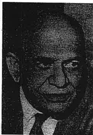
Dr. V. R. Khanolkar