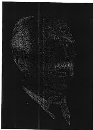
Mr. Justin Godart