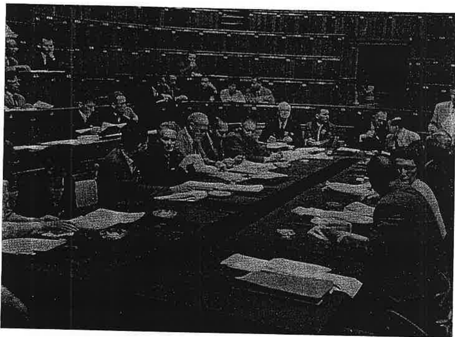
One of the many Symposia organized by the UICC (Symposium on Cancer Chemotherapy, Louvain, 1960)

of an International Cancer Research Commission as a separate body to the UICC. After long debate, the sponsors of the project agreed that the UICC should be associated with the commission. As an autonomous body, however, it led a somewhat precarious existence and subsequently survived only by becoming the UICC Research Commission with its administration entrusted to the Executive Committee.