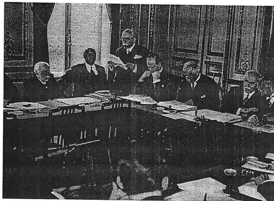
One of the first meetings of the Executive Committee of the UICC