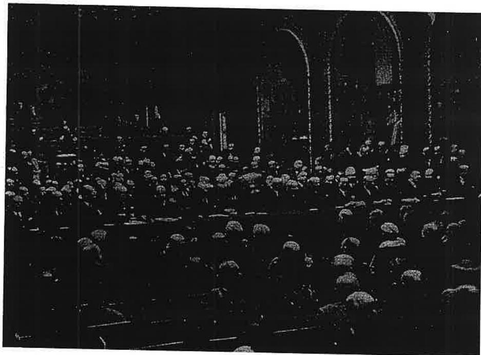
Second International Cancer Congress, Brussels, September 1936