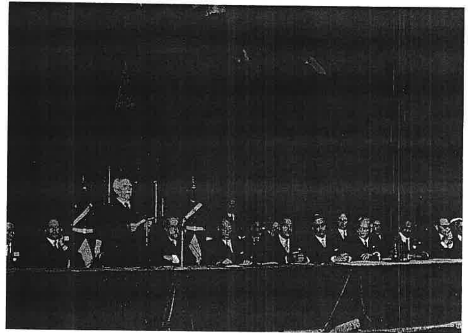
Vth International Cancer Congress, Paris, July 1950, Opening Ceremony

Cancer research in the United States by this time was moving ahead on an immense scale. Feeling that the international community should be associated in this work, the United States delegation proposed the establishment